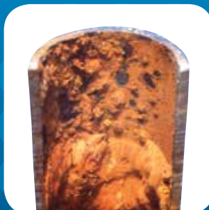
Galvanised pipe heavily corroded