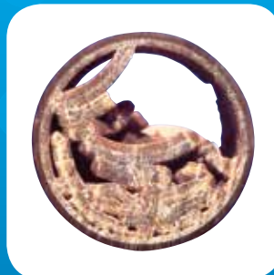
Copper pipe with scale plug

Softwater is water that contains very little natural minerals; this 'pure' water is actually aggressive to metals and causes corrosion. Consequently the tap water turns brown. Leaks and burst pipes may be the result.