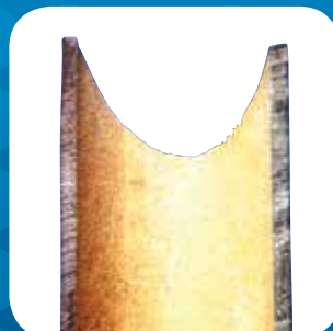
Combiphos protective layer